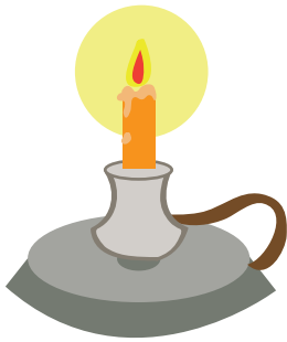
Lighting a room with candles