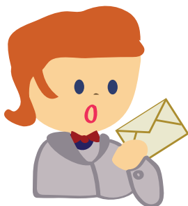
Sending people to deliver messages